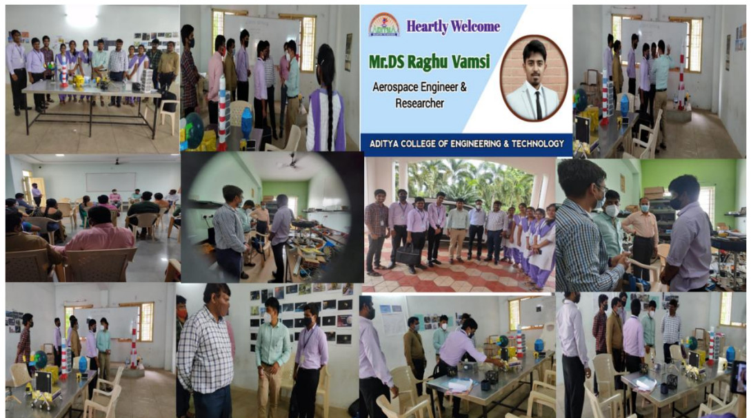
Gallery coverage of on Basic model of NANO Satellites