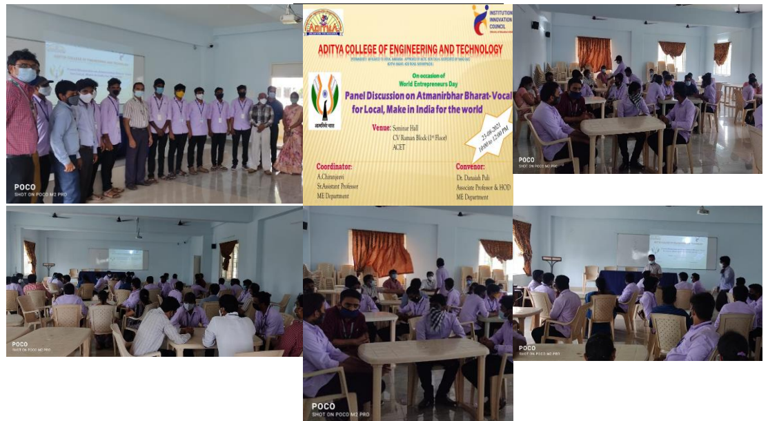
Gallery coverage of Panel Discussion on Atmanirbhar Bharat- Vocal for Local, Make in India for the world