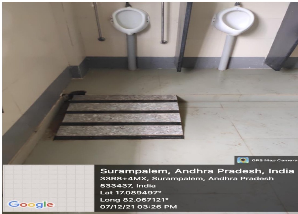
Ramps for wheel chair in washrooms