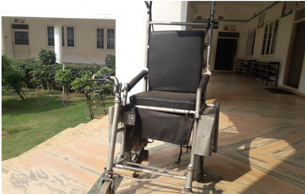
Wheel chair disabled- friendly

Aditya Nagar, ADB Road, Surampalem - 533 437, E.G.Dist., Ph: 99631 76662.