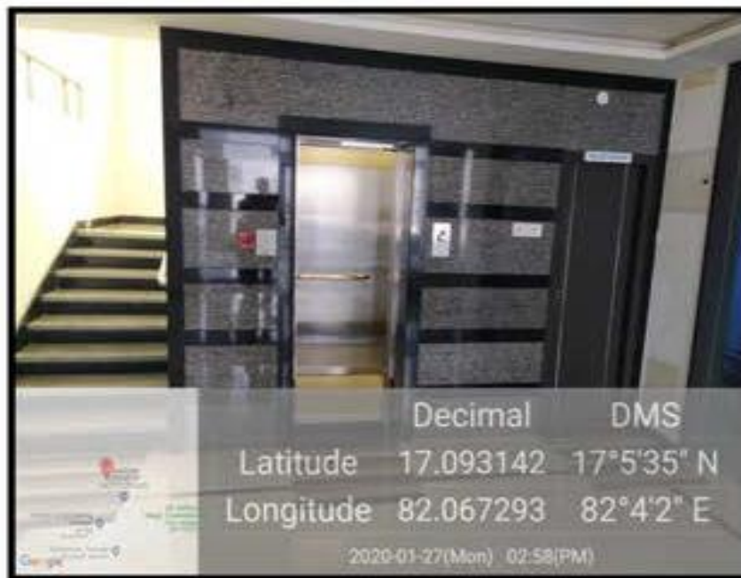
Lift in James Watt Bhavan