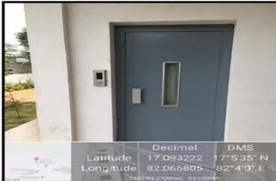
Lift in James Watt Bhavan

Aditya Nagar, ADB Road, Surampalem - 533 437, E.G.Dist., Ph: 99631 76662.