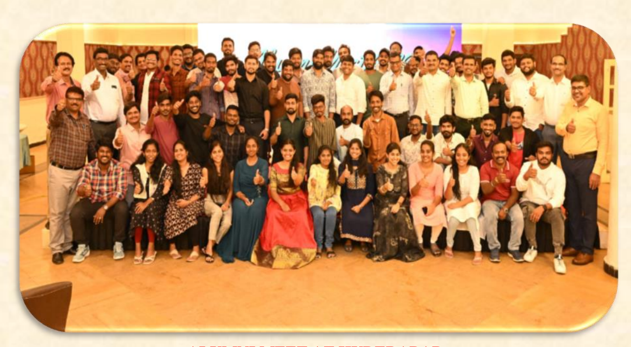
ALUMNI MEET AT HYDERABAD