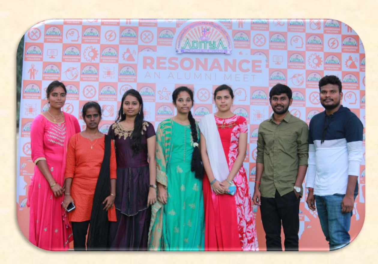
ALUMNUS AT WELCOME POSTER