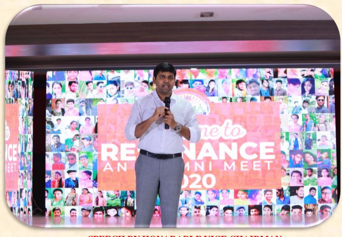
SPEECH BY HONARABLE VICE CHAIRMAN