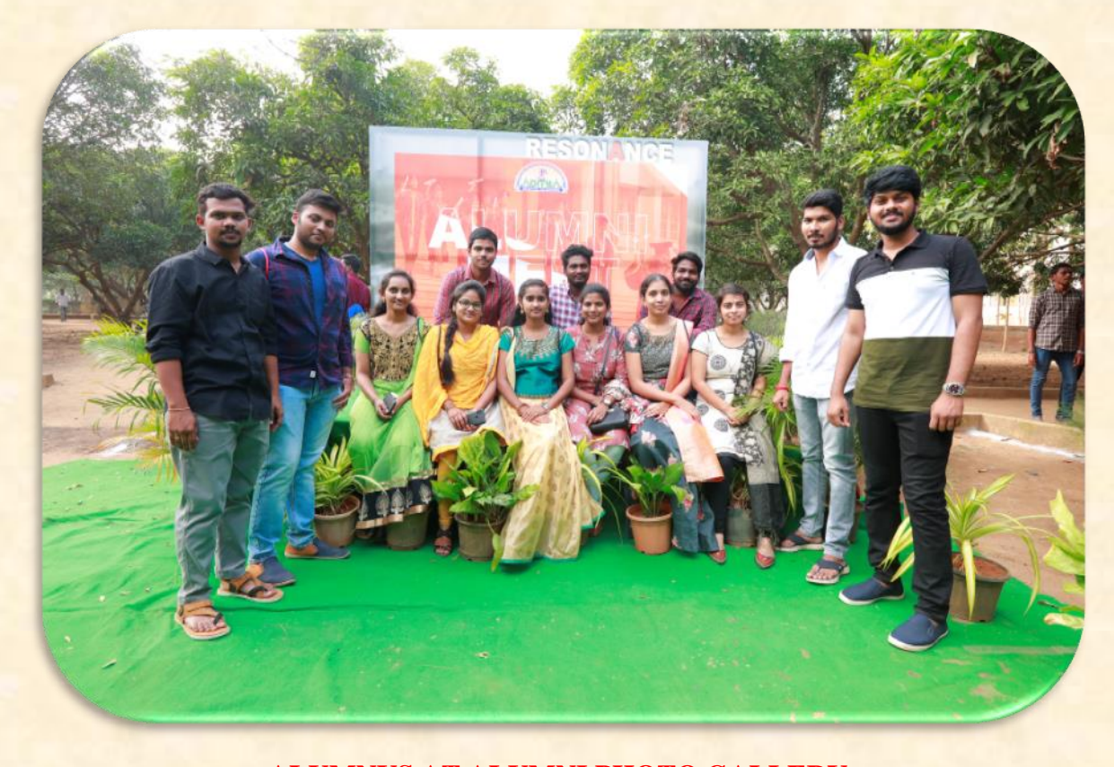
ALUMNUS AT ALUMNI PHOTO GALLERY