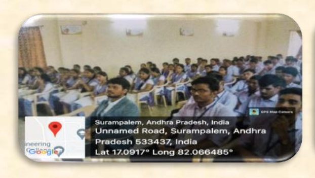
Explore Your Options