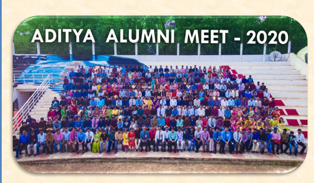
INAUGURAL GROUP PHOTOGRAPH