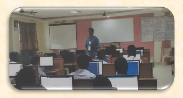
Sixth Sense Technology