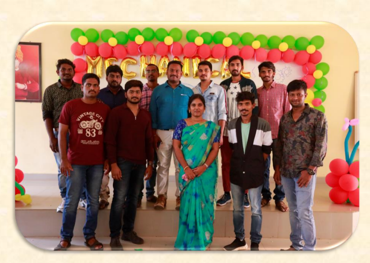
ALUMNUS GATHERING AT DEPARTMENTS