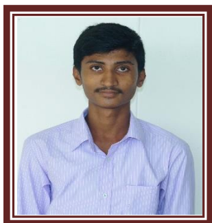
CH NANI 19P35A0251 7.27 SGPA