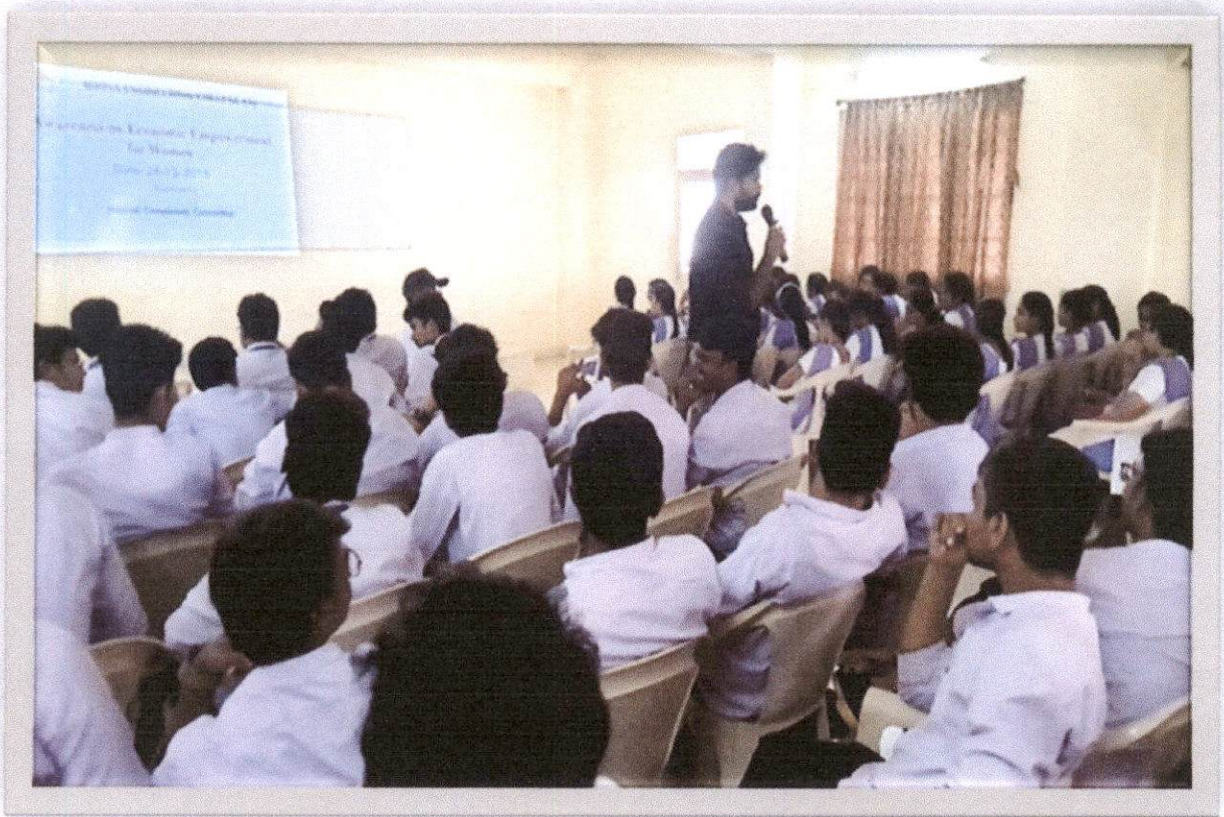
Students attending the programme “Awareness on Economic Empowerment for Women”