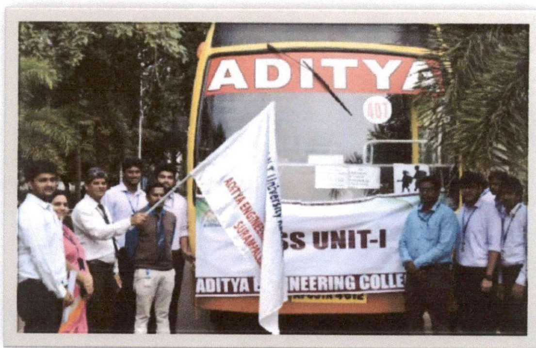
Starting from the college by bus