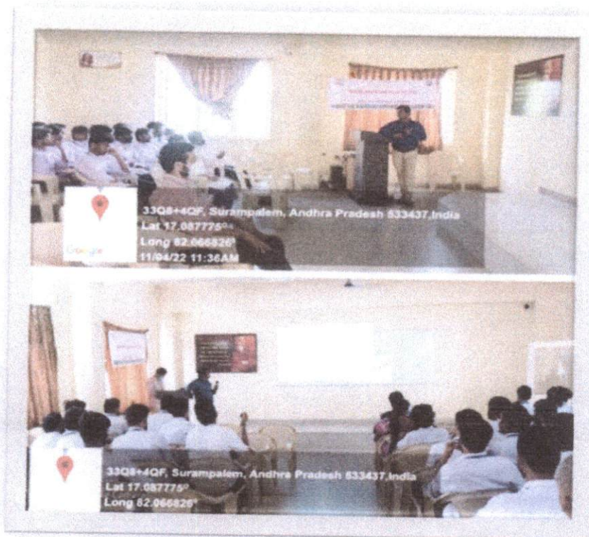
Delivering lecture on Writing Research Report