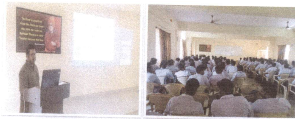
Delivering lecture on Research Methodology & Manuscript Writing