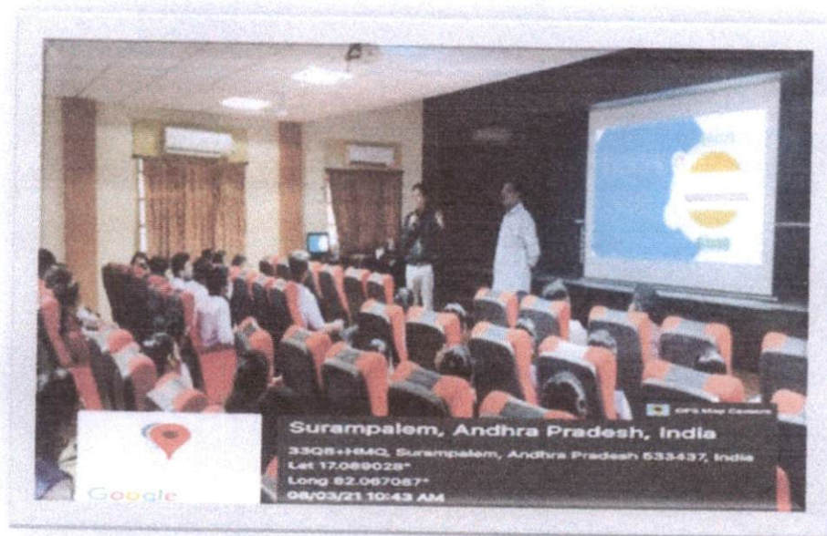
Resource Person lecture

Closing remarks : HOD had given closing remarks by giving a vote of thanks. HOD concluded the six days training on Entrepreneurial Development Skills in Higher Education Institutions by presenting the speaker with a memento. At the end of the program convener handed over Rs.66120/- to the speaker as a token of gratitude.