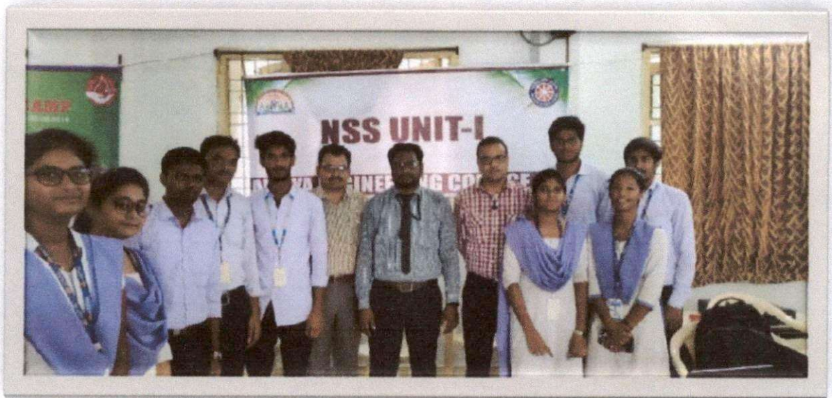
Students participated in blood donation along with Programming officers