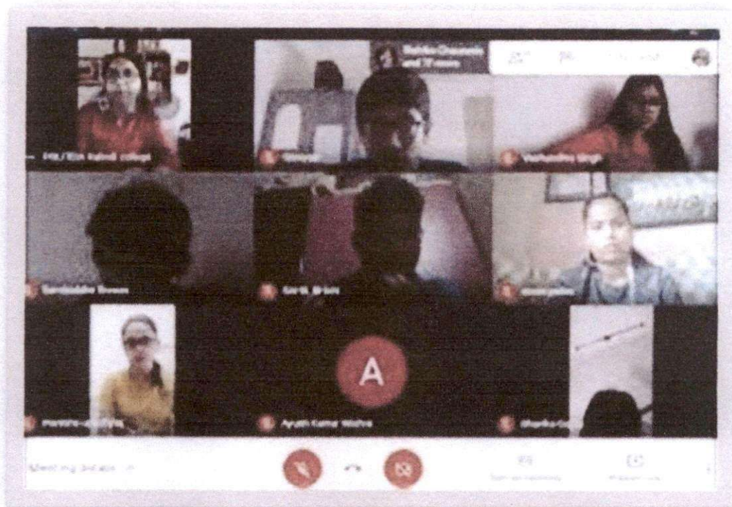
Online interaction to create an awareness on Prevention of Non communicable diseases