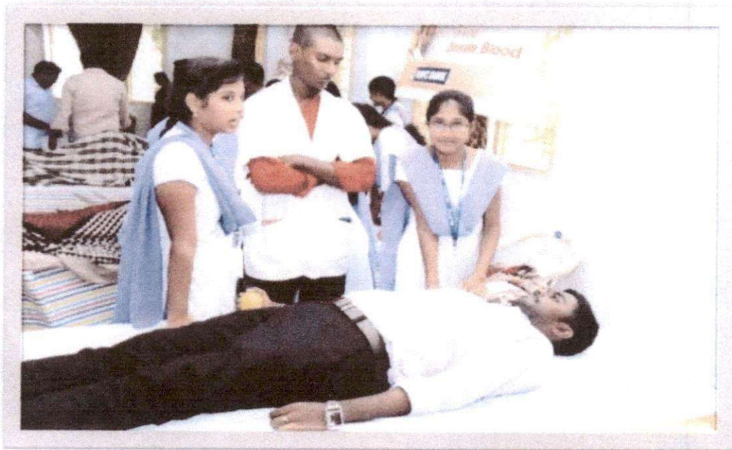
Students participated in blood donation