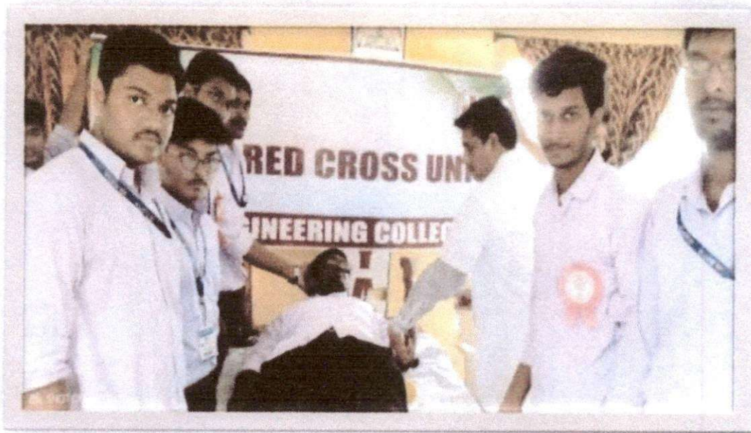
Students participated in blood donation