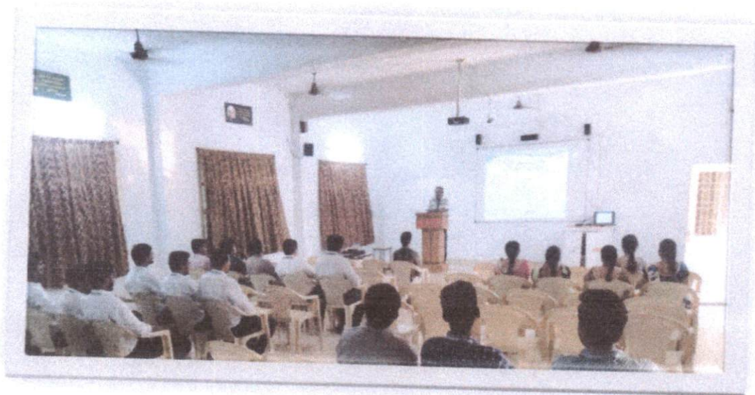
Interaction of students with the Guest speaker