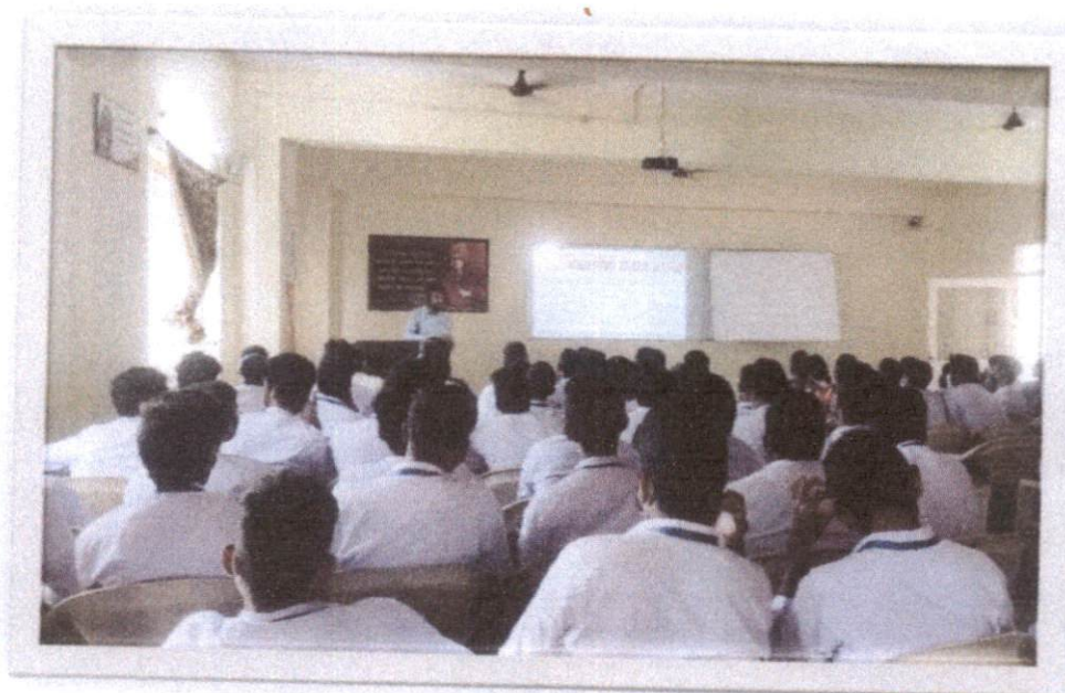
Resource person delivering the content