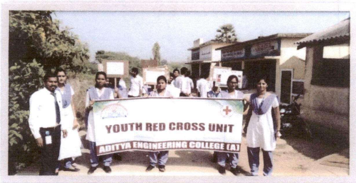
Students participated in Awareness rally along with Programme officer