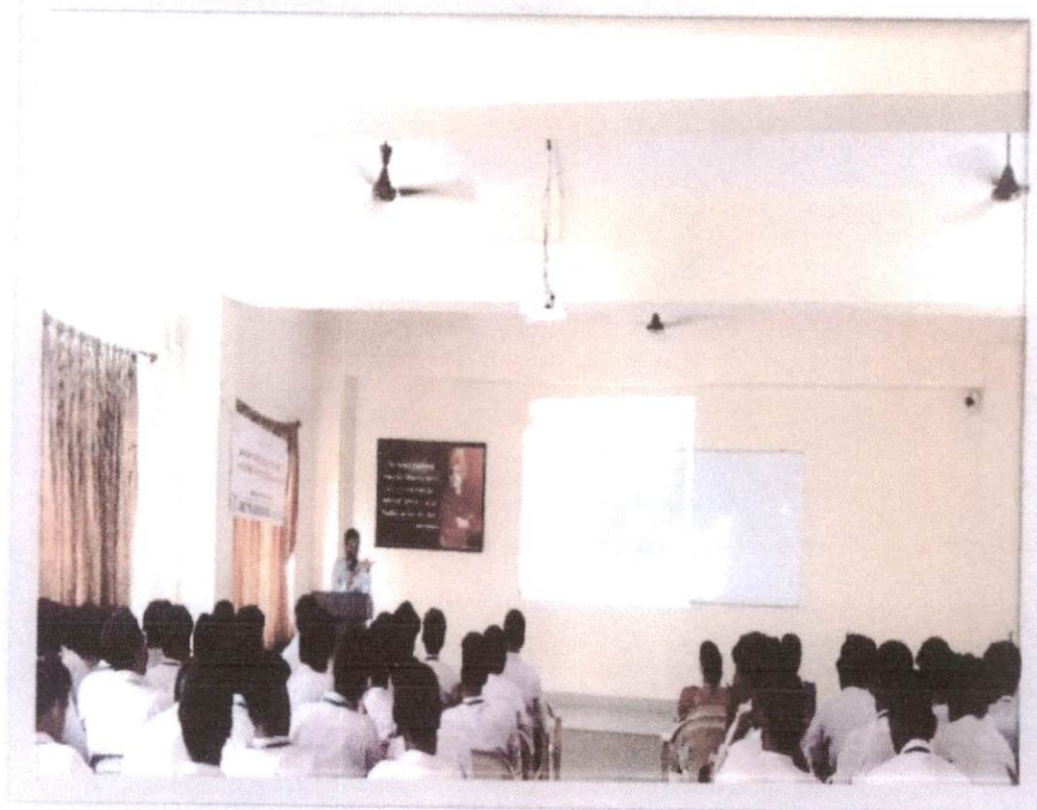
Guest Interacting with Students