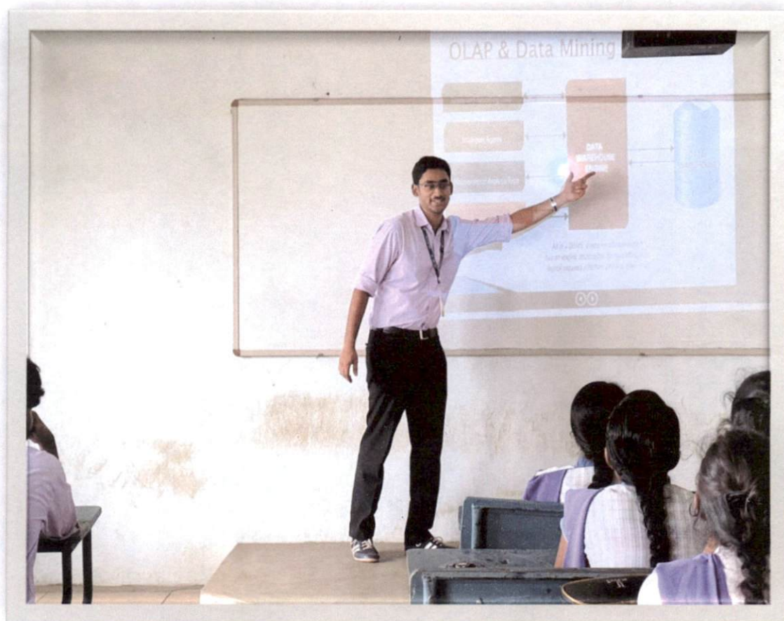
Student Seminar on OLAP & Data Mining Tools

Topic: OLAP (Online Analytical Processing) Approach in Data Mining