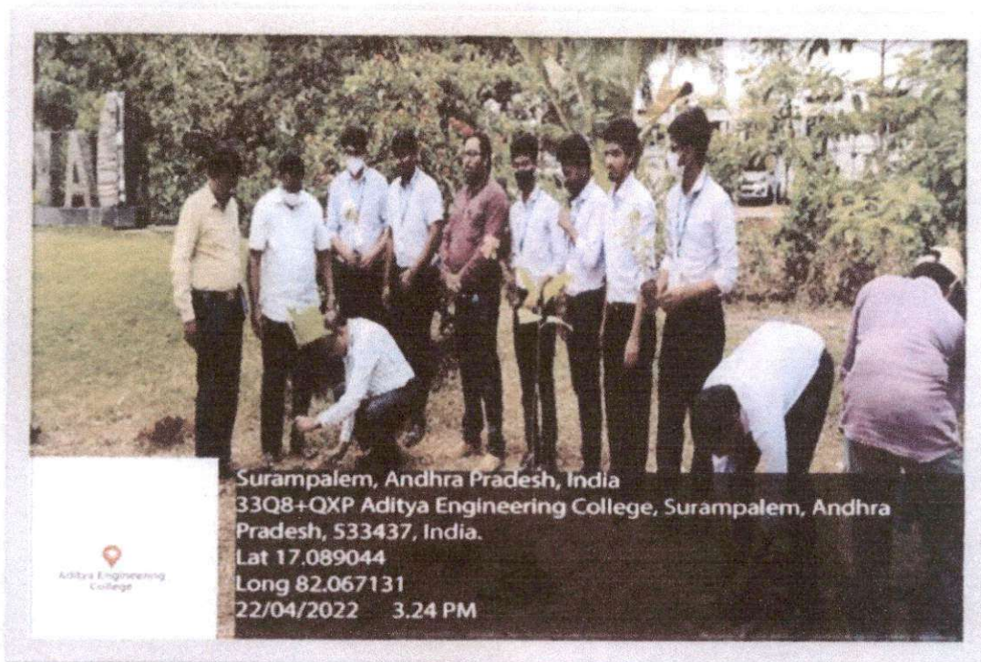
Principal and student planting trees