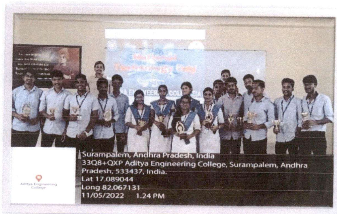
National Technology Day active participants and winners