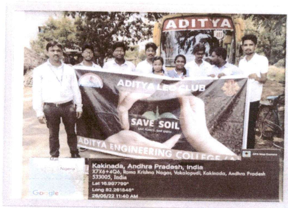
Students Near Aanuru Village