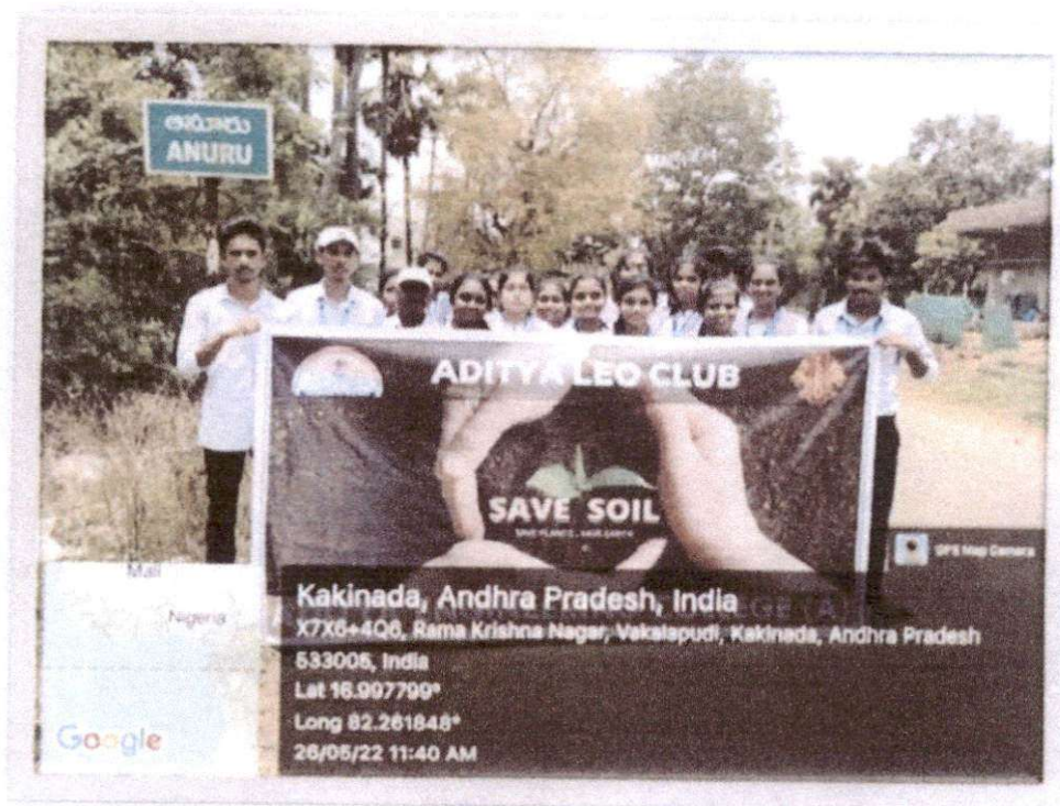
Students At Aanuru Village